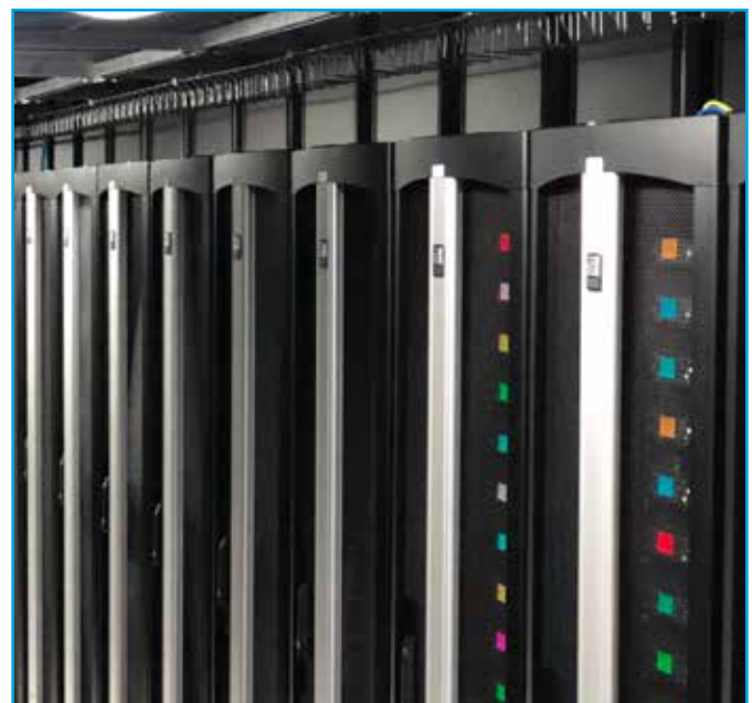
Increasing demand for higher rack densities drove Xfernet to deploy a reliable data center infrastructure comprised of cabinets and cabinet-level containment.