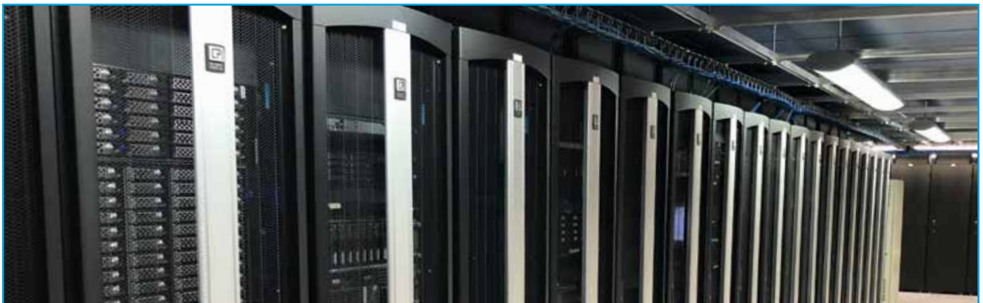
F-Series TeraFrame Cabinets with Vertical Exhaust Ducts are the standardized solution in Xfernet’s Los Angeles data center.